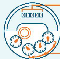
Numbers and clock meter